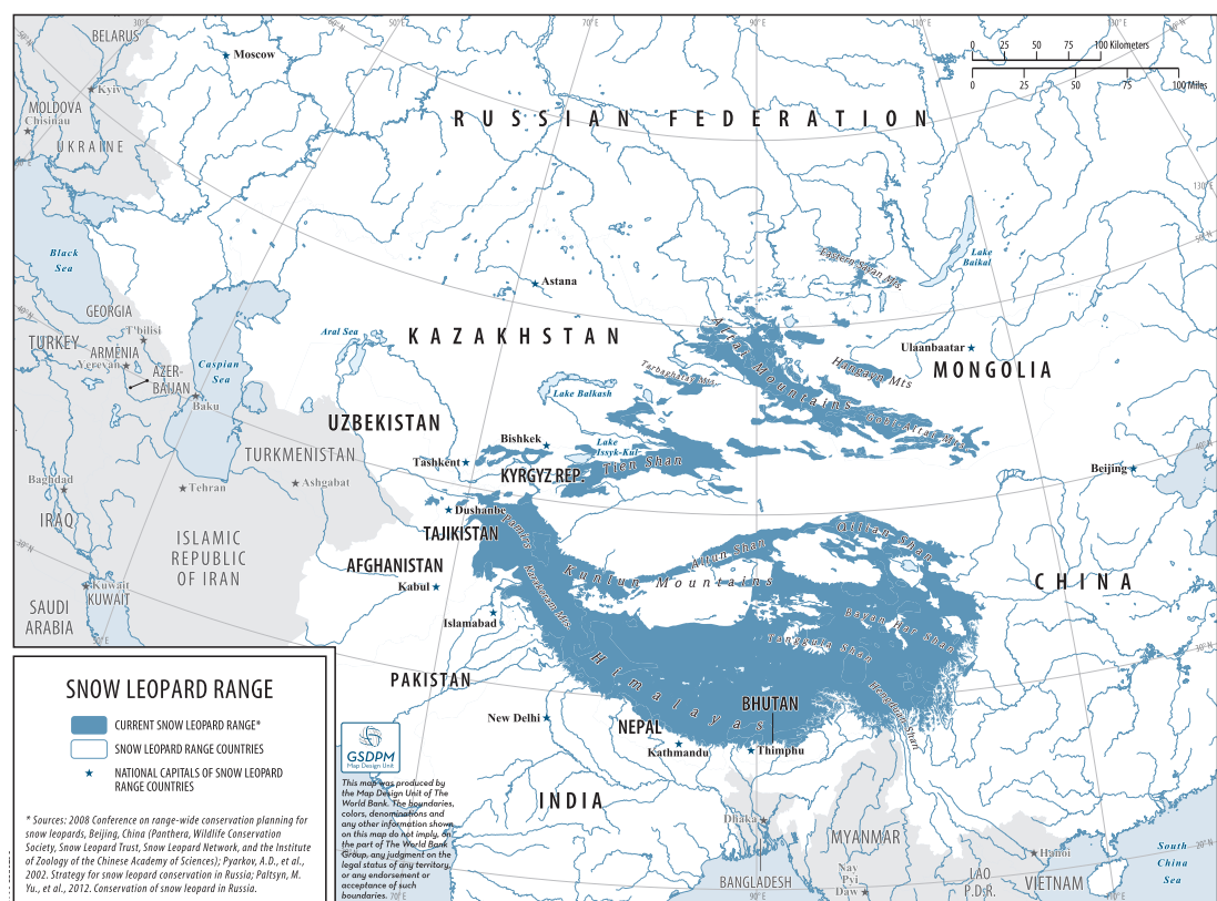
FIGURE 1. SNOW LEOPARD RANGE

The estimated size of its distributional range is about 1.8 million km 2 , with the largest share in the Tibetan plateau of China, followed by Mongolia and India. There is, however, a great deal of uncertainty about the snow leopard's current distribution, as there is about the size of the total snow leopard population, which is roughly estimated at between 4,000 and 6,500 individuals. As indicated in Table 2, some national estimates are very outdated and up-to-date estimates of area of occupancy and population size are urgently needed.